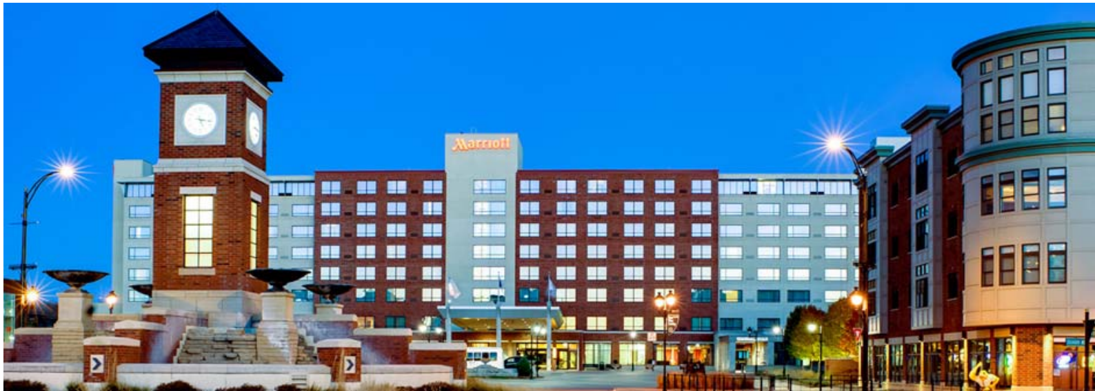
Coralville's Iowa River Landing Revitalization Area

In June of 2015 the EPA announced that, "Since the inception of the EPA's Brownfields Program in 1995, cumulative brownfield program investments have leveraged more than $22 billion from a variety of public and private sources for cleanup and redevelopment activities. This equates to an average of $17.79 leveraged per EPA brownfield dollar expended. These investments have resulted in approximately 105,942 jobs nationwide." (EPA, 2015 News Release)